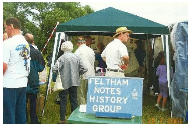
(the opening image was of the groups attendance at the 2001 Bedfont Lakes Country Fair)

The Chair's introduction consisted of a reminder as to annual subscriptions for year 2025/26 being due.