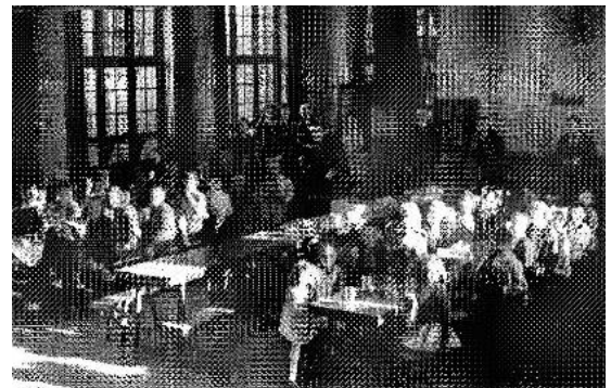
Feltham Hill School V.E. Day (Victory Day) Celebration Dinner

Oak Hill Academy (Feltham Hill Junior School) Visit – members of the group attended the school in order to judge the pupils on their project pertaining to World War Two and in particular the way it affected children and young people. The judging was difficult not least through the subject being well researched and all responses were commendable.