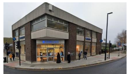
Barclays Bank- - who or what next?