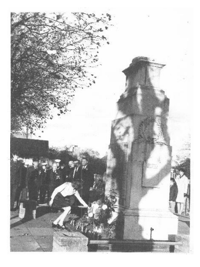
'only the forgotten are dead'

The meeting finished with the Chair giving detail on the November meeting which will feature more Feltham specific items together with our usual remembrance time reflections by the Chair